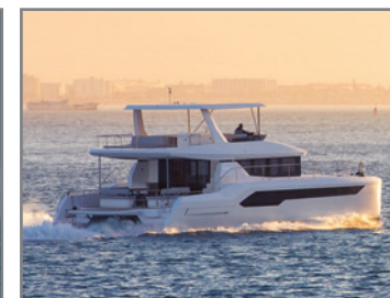
LEOPARD 53 PC