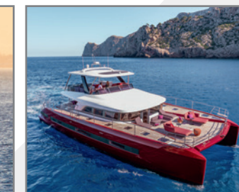
LAGOON SIXTY 7