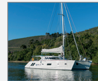
KNYSNA 500 SE