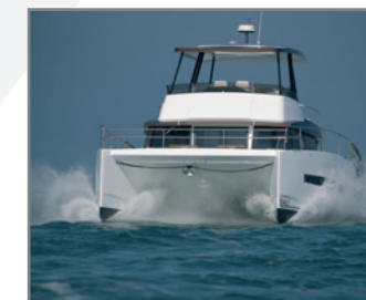
BALI 4.3 MY