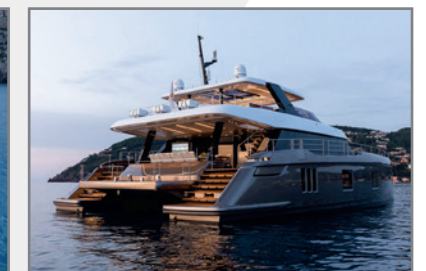
80 SUNREEF POWER