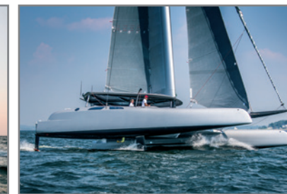
EAGLE CLASS 53