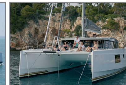
NEW 46 OPEN