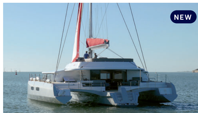
NEW NEEL 65 Evolution

Builder: Sunreef Yachts - Length: 18.40 m - Beam: 10.20 m Light displacement: N/A - Draft: 1.90 m - Mainsail area: 110 m 2 - Genoa: 90 m 2 Spinnaker: 300 m 2 - No of cabins: 4/6 - Water: 800 l. - Diesel: 1,000 / 1,750 l. Motors: 2 x 75 - 100 HP - Price: n/a