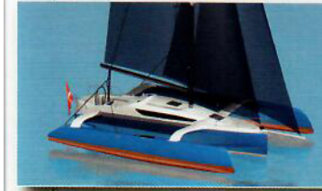
DRAGONFLY 32 EVOLUTION