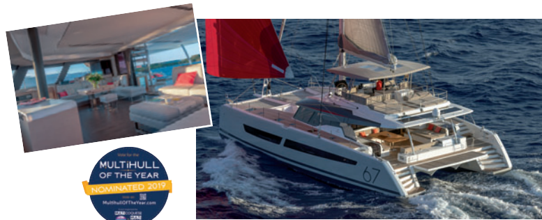
ALEGRIA 67 NEW

If you are looking for a beautiful cruiser, this is the family of boats where you'll surely find what you're looking for: multihulls between 50 and 70 feet indeed offer volume, luxury and a remarkable level of comfort for life on board. But they're boats that remain manageable for a family crew: the ultimate object of desire!