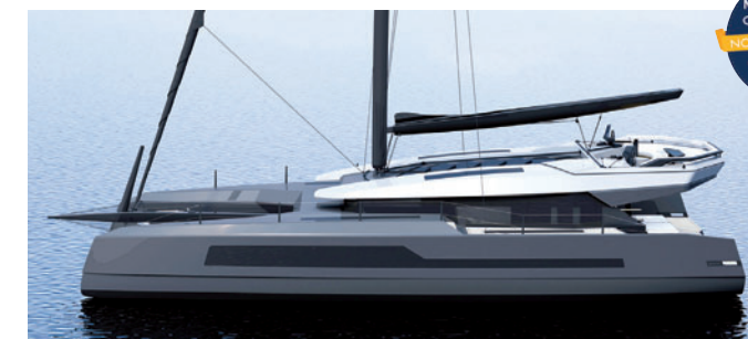
NEW Mc CONAGHY 60

Builder: Gunboat - Length: 20.75 m - Beam: 9.10 m - Light displacement: 17,800 kg Draft: 1.20 / 4.10 m - Mainsail area: 142 / 175 m 2 - Genoa: 66 / 77 m 2 Spinnaker: 325 / 433 m 2 - No of cabins: 4 / 5 / 6 - Water: 2 x 378 l. Diesel: 2 x 378 l. - Motors: 2 x 80 HP - Price: On request