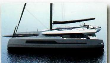
MC CONAGHY 60