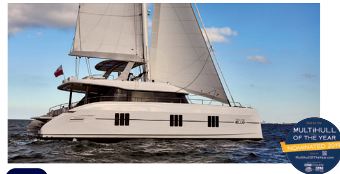
NEW SUNREEF 60

Builder: Hudson Yacht and Marine - Length: 15.19 m - Beam: 7.44 m Light displacement: 13,150 kg - Draft: 1.56 m - Mainsail area: 81 m 2 Genoa: 44.5 m 2 - Spinnaker: 135.5 m 2 - No of cabins: 3 - Water: 400 l. Diesel: 2 x 300 l. - Motors: 2 x 40 HP - Price: US$ 1,200,000 ex-tax