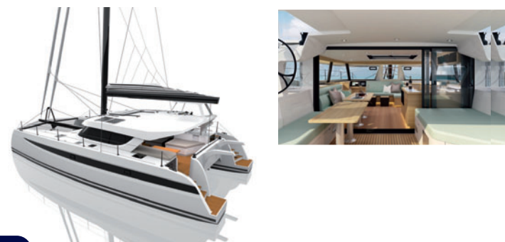
NEW HH 50 OC

Builder: Sunreef Yachts - Length: 15.20 m - Beam: 9.10 m - Light displacement: n/a Draft: 1.50 m - Mainsail area: 80 m 2 - Genoa: 79 m 2 - Spinnaker: 200 m 2 No of cabins: 5 - Water: 800 l. - Diesel: 1 000 l. - Motors: 2 x 80 HP Price: Euros 1,300,000 ex-tax