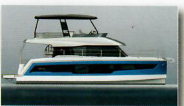
FONTAINE PAJOT MY 40