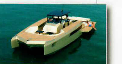
OPEN 40 SUNREEF POWER