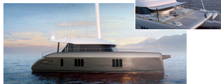
NEW SUNREEF 50

Builder: Bali Catamarans - Length: 16.80 m - Beam: 8.74 m Light displacement: 22 t - Draft: 1.48 m - Mainsail area: 99 m 2 - Genoa: 58 m 2 Spinnaker: NC - No of cabins: 4/5/6 - Water: 1,200 l. - Diesel: 1,200 l. Motors: 2 x 60/80 HP - Price: Euros 755,400 ex-tax