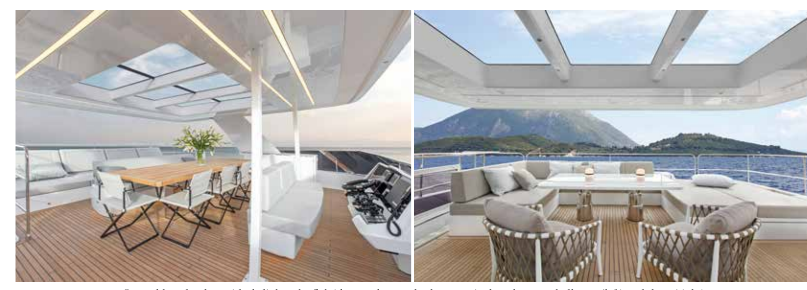
Covered by a hardtop with skylights, the flybridge can be completely customised as shown on hulls one (left) and three (right)