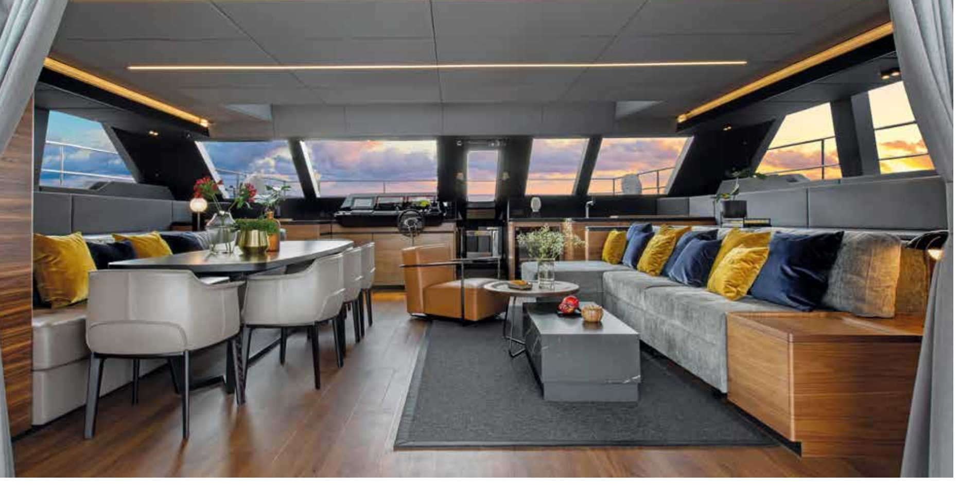
Otoctone 60, the third unit, also features a galley-down layout with a darker décor lightened by grey and brown furniture, and colourful cushions

The vacht's scale is also evident on the enormous flybridge, which is almost completely covered by a hardtop with central skylights. The layout can be completely customised and exciting options including a full-width sunbathing area aft, with or without a spa pool.