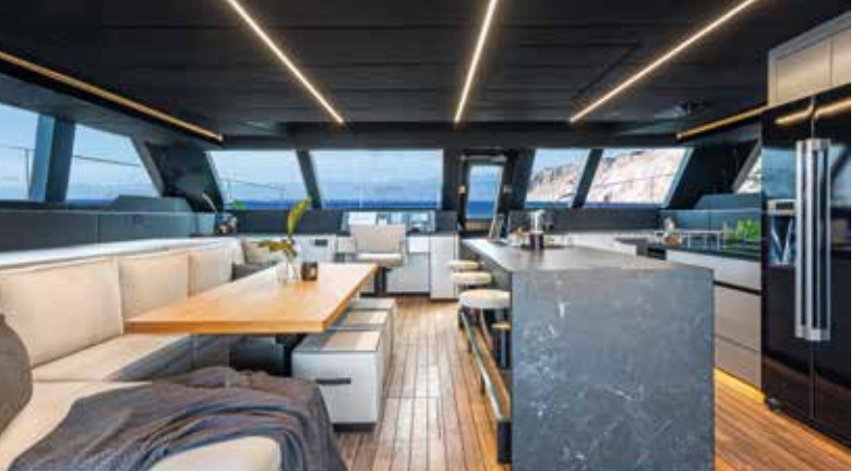
The galley (left) in the starboard hull of Otoctone 60; hull two, Gypsy Soul, features the galley-up layout (right), dominated by a huge island kitchen