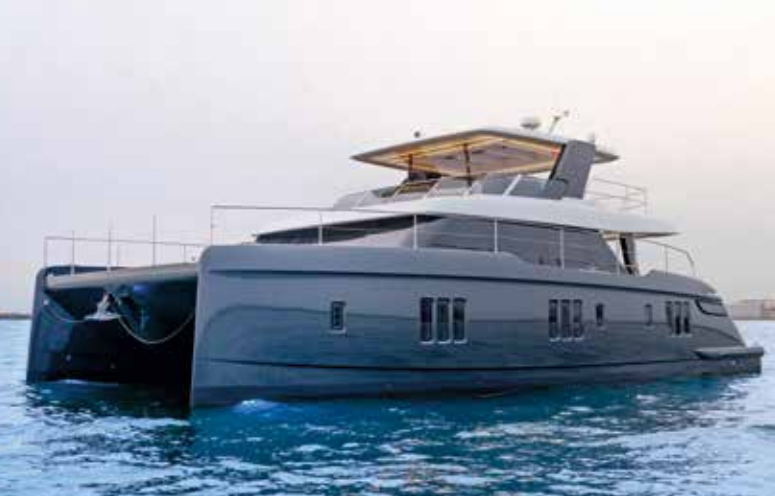
The hydraulic platform (left) can carry a tender and create a 35ft-wide swim platform; the 60 Sunreef Power (right) is part of a range with 70, 80 and 100 models