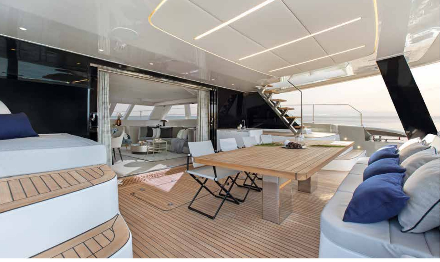
The cockpit can have a huge aft sofa that reclines into a sunbathing area, a dining table for 10, raised day bed to port and wet bar to starboard

hen Otoctone 60, the third 60 Sunreef Power. is delivered to her owner this summer, she will be united for the first time with her big sister, Otoctone 80, the second 80 Sunreef Power, with both yachts available through Sunreef Yachts Charter.