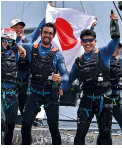
Racing: Japan win Italy Sail Grand Prix