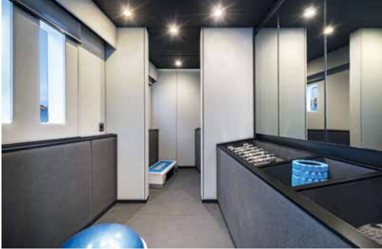
Hull two features a gym forward of the master suite in the port hull

The master cabin in the port hull has a king-size bed midships, a desk/vanity table and an aft walk-in dressing room that leads through to a large bathroom with walk-in shower.