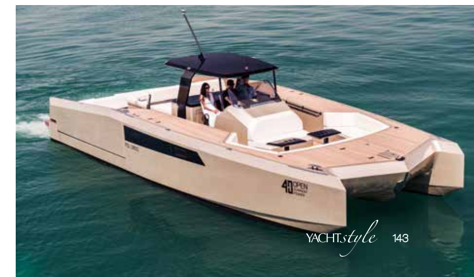
The 40 Open Sunreef Power

We have our new range of sail catamarans coming with first launches to take place this year. Otherwise, we are very excited to bring the 40 Open Sunreef Power to Cannes. It also looks like our family of power cats is soon going to grow! ☺