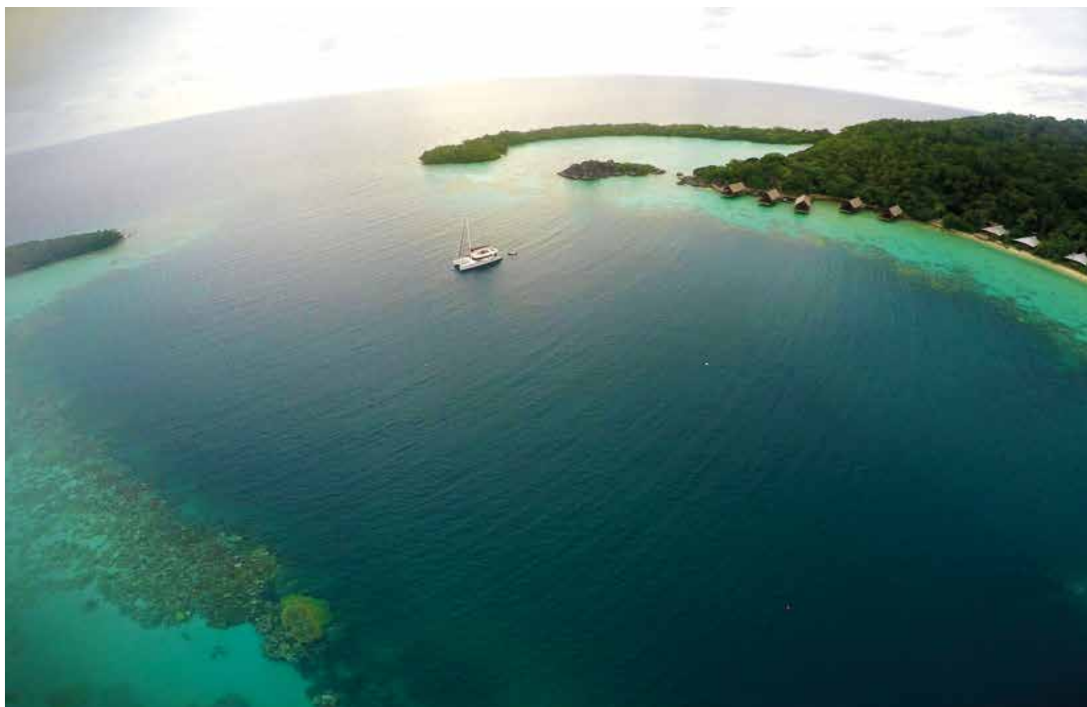
Pulau Bawah, starting point for Blaze 11 charters in the Anambas, and later on, a call at capital and administrative centre Tarempa

the local delicacies like nasi dagang, roti rendang, smokey tongkol, or the popular mie Tarempa which is spicy fried noodles with fish and egg. Local cultural events are organized now and then, such as a dance or kite-flying. Or you might catch a local wedding.