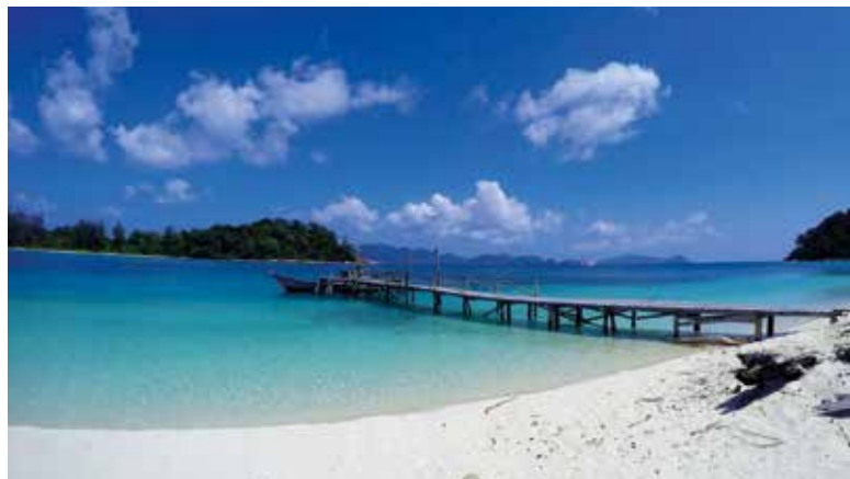
Jetty at Padang Melang, popular for watersports like paddling and kayaking

At Nongsa Point, your captain arranges for clearance into Indonesia. You may go ashore to walk around and have a look at the marina. After completion of formalities, set sail for the Anambas Islands.