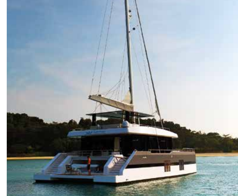
The Sunreef Supreme 68 Eagle Wings

How has the past year been for SUNREEF Yachts? We see lots of activities, launches and deliveries. Tell us more.