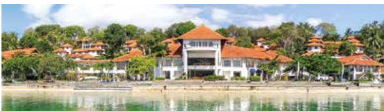
Nongsa Point Marina

After breakfast, set course for the return trip to Nongsa Point Marina. Help take the helm, trim the sails, or lounge in the spacious cockpit or on the flybridge. Curl up with a book and relax in the stillness without interruptions. Then again, you might have a tuna striking the fishing lines, or dolphins surfing on the bow waves.