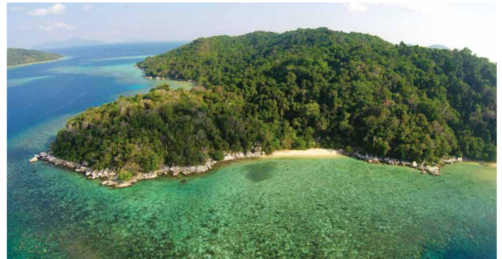
Largely uninhabited Lubang Tamban makes one feel like a modern-day Robinson Crusoe

Dine onboard, or enjoy a local dinner with fresh seafood at one of the lively restaurants in town. Highly recommended is to try some of