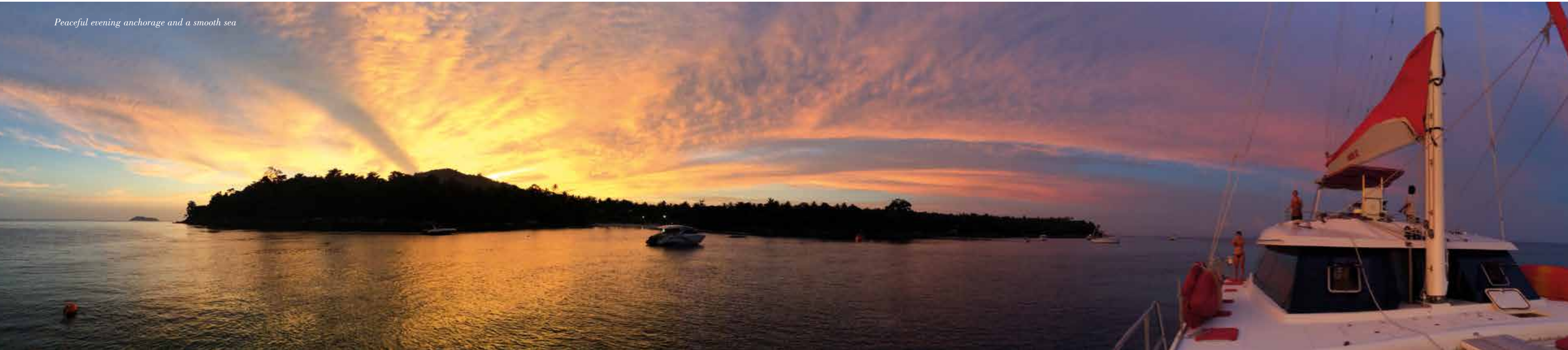
Peaceful evening anchorage and a smooth sea

A nambas has a lot more to offer. These pristine waters are a truly tropical paradise, largely undiscovered by passing yachties and private motor vessels. Here you can step back in time, swim in warm blue seas, azure lagoons, and view underwater scenery unparalleled in Asia.