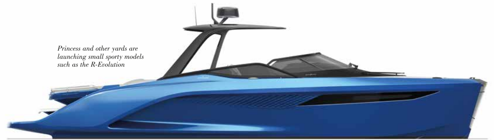
Princess and other yards are launching small sporty models such as the R-Evolution

For more on its recently announced collaboration with The Netherlands' Icon Yachts to build a 49m aluminium motor yacht, see