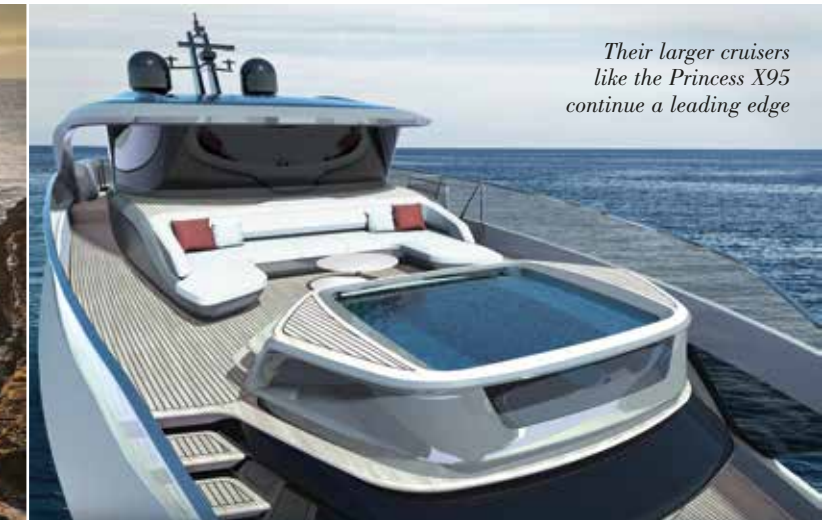
Their larger cruisers like the Princess X95 continue a leading edge

the Monaco Yacht Show report that follows. Demand for the company's larger models continues to grow year-on-year, with more than 125 yachts over 100 feet in length already delivered. The British yard's major shareholder is Beijing-based Wanda Group, which has provided long-term financial and strategic backing since 2013.