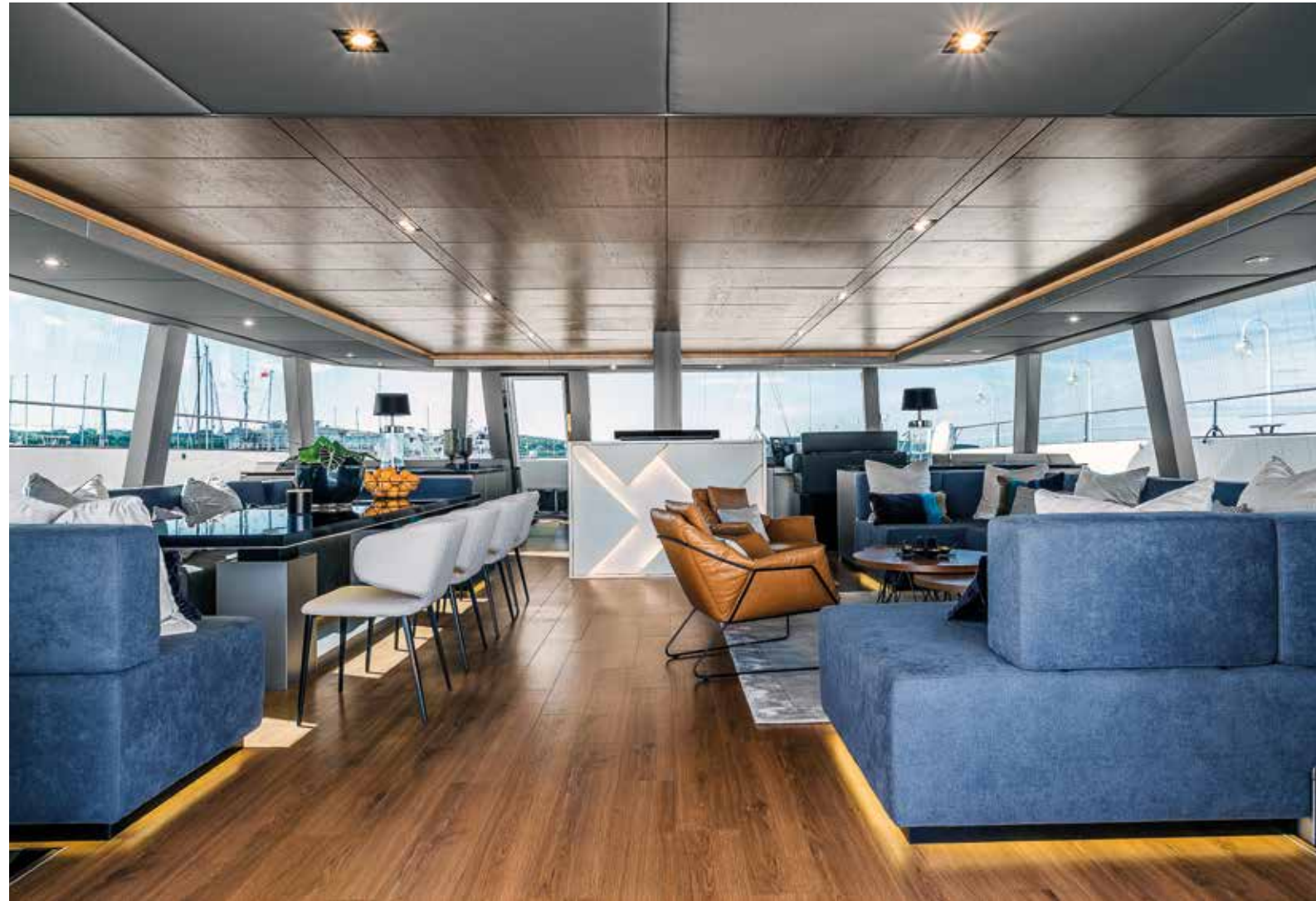
Top: One of the many highlights of the new Sunreef 80 is its enormous main deck, which has many options for customisation; towards the bow, a custom-built island cabinet conceals a retractable TV and a big wine cooler to add to the enjoyment; and aft deck alfresco dining area.

The Sunreef 80 was the largest sailing yacht at the Cannes Yacht Festival, but until you get on board it is hard to imagine just how spacious this luxury sailing yacht is: 340sqm of living space made it an absolute showstopper!