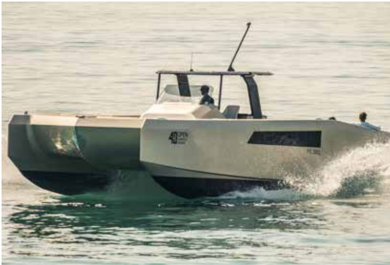
Sunreef 40 Power opens out into a superbly-designed small beach club