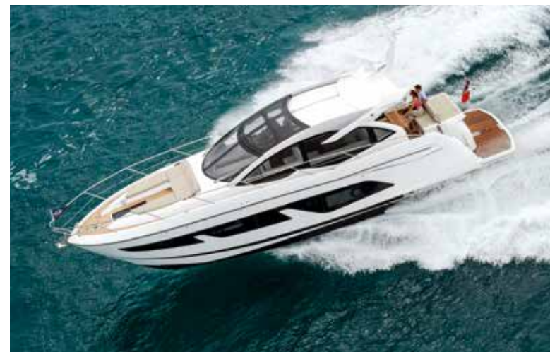
Sunseeker debuted its 74 Sport Yacht, reviewed elsewhere, and the Predator 50 here was at both Cannes and Southampton, an overlapping event

Space limitations obviously preclude looking at anything but a small selection of the hundreds of boats on display, but many new models are separately previewed in Yacht Style #43 or are reviewed in this Yacht Style #44 issue.