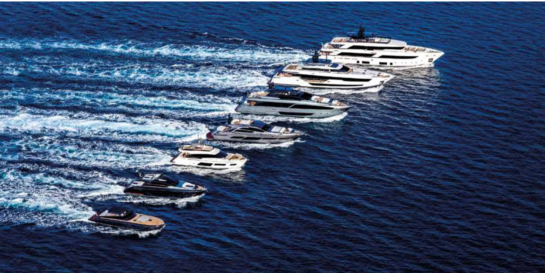
Ferretti's fleet, which has some Chinese equity investment, was highly successful at Cannes. Some spectacular Rivas and Pershings arrive in Asia in 2019

Other awards went to the Fairline 43 Open, Princess 55 Fly, Azimut S6 and 55 Fly, Galeon 460 Fly, Sanlorenzo SX76, SL102 AS and 500EXP, Azimut Grande 32 Metri, Gulf Craft 140, Benetti 50m, Heesen Irisha , Oceanco Dar , Mairo 36, Canados 888 Evo, Sirnea 58 and Tankoa 72m. ✽