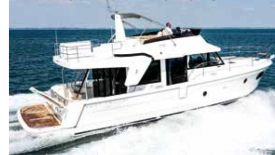
Beneteau group's new Swift Trawler 47 combines robust design with style and long-range capabilities

CNB showed its latest 66 model and big brother, the CNB 76, at Genoa as well, while Monte Carlo had its seven yacht range from 65