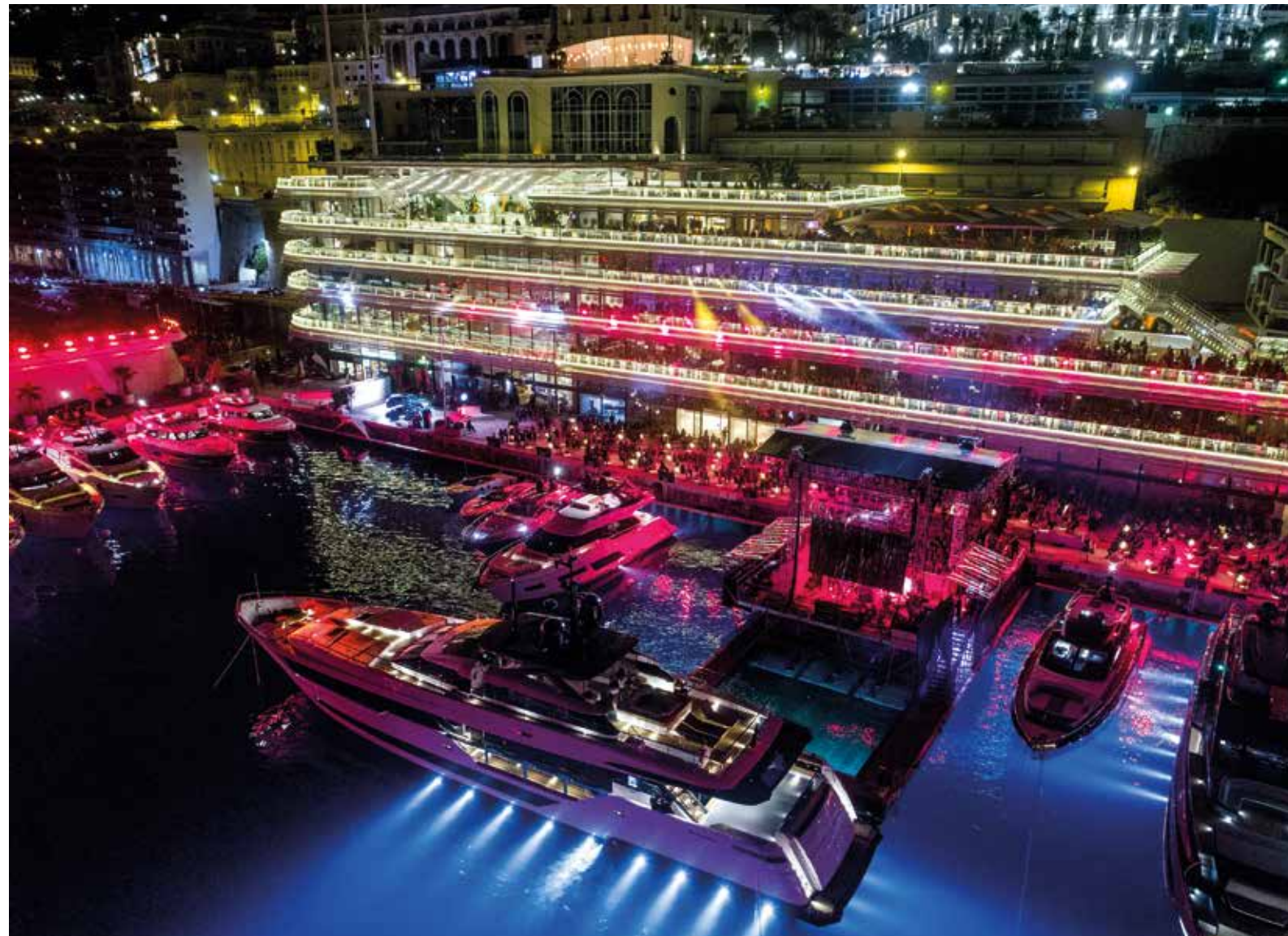
Upmarket satellite parties are held anywhere from castles in La Napoule to the lovely Hotel du Cap Eden Roc in Antibes. Shown above, Ferretti group makes use of Monaco Yacht Club for a pre-Cannes VIP event around their 50 th Anniversary

Only big brokerage boats, and since last year the “toys” bought by owners for their vessels, have hitherto been located at Port Canto.