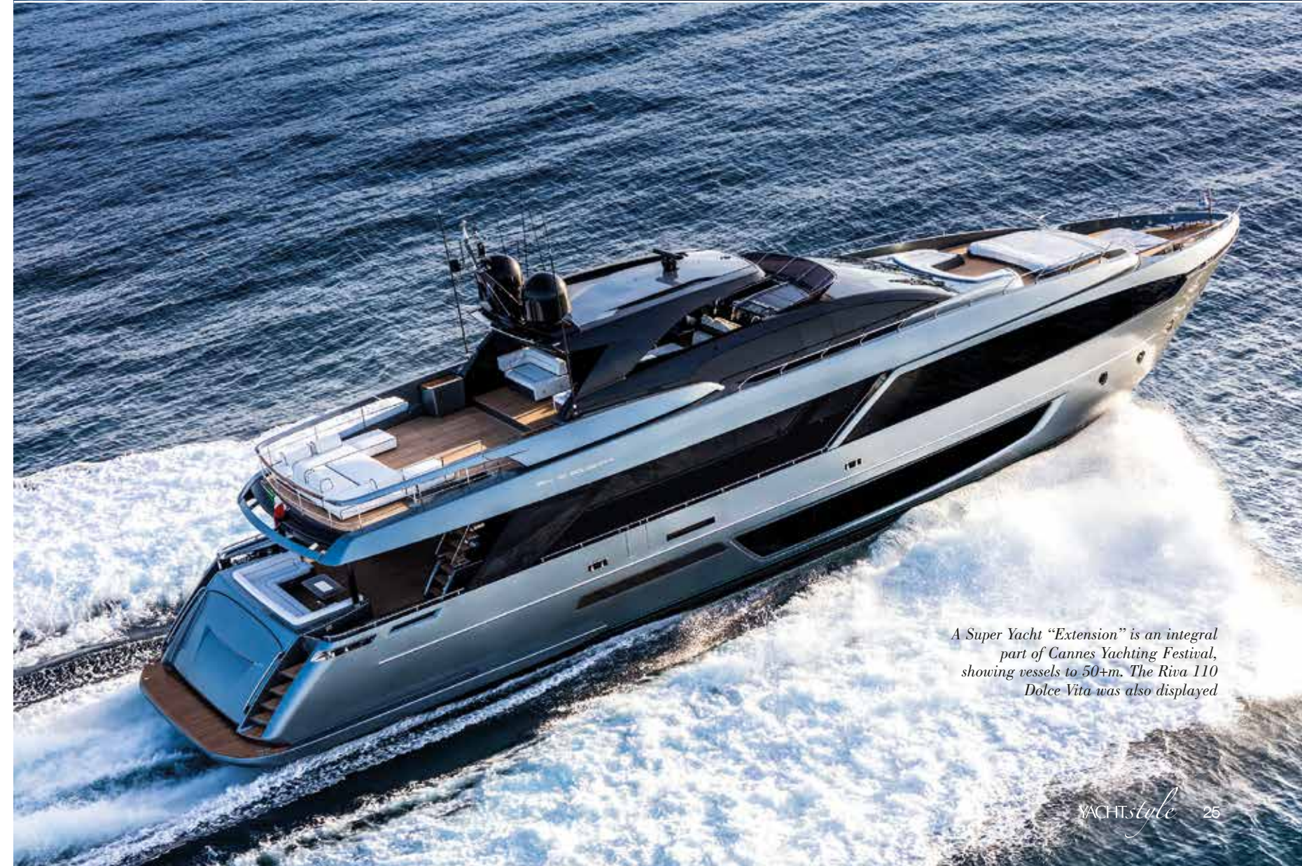
A Super Yacht “Extension” is an integral part of Cannes Yachting Festival, showing vessels to 50+m. The Riva 110 Dolce Vita was also displayed