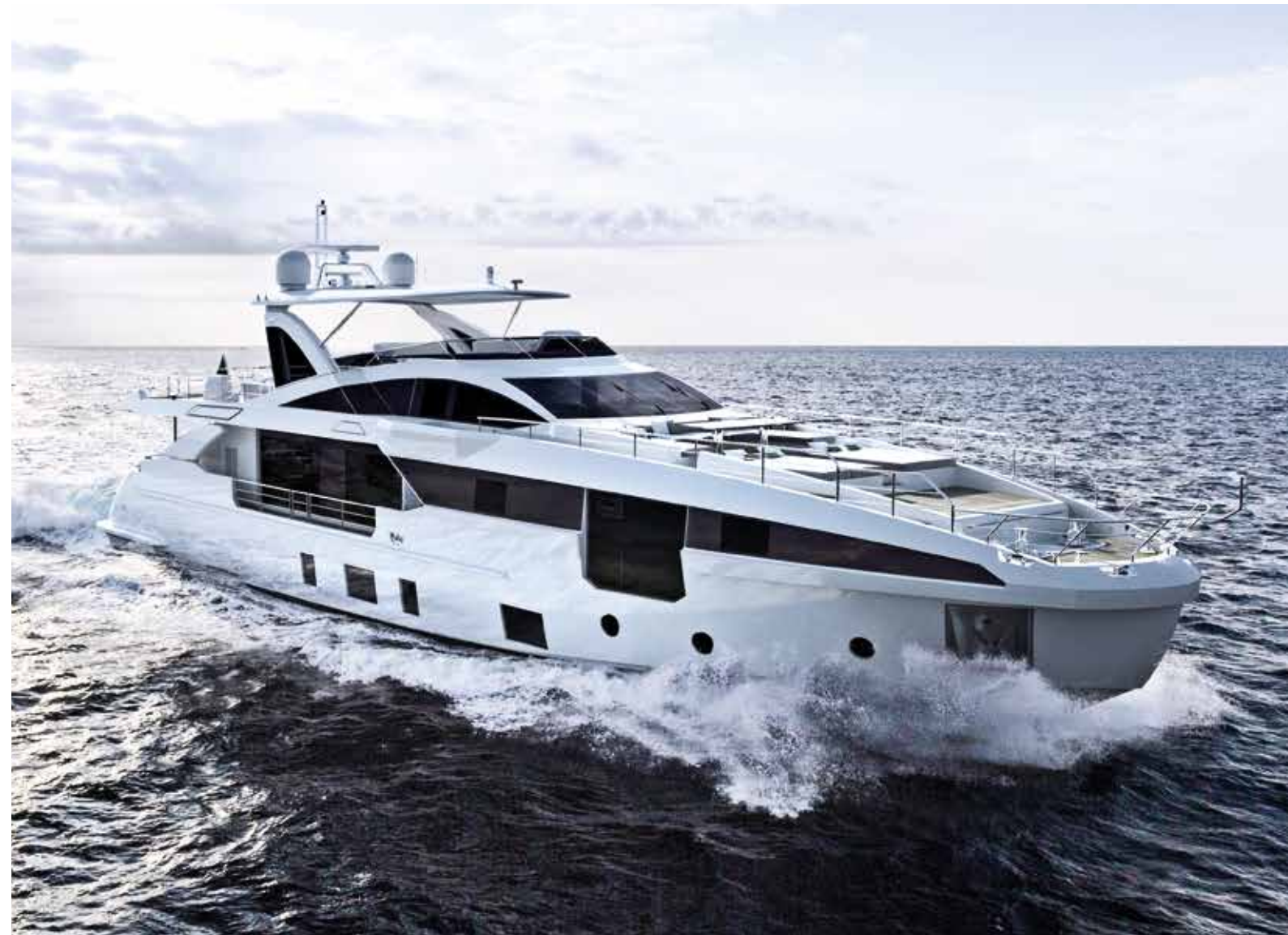
Azimut Grande 32 Metri awards included an interior design trophy. She is the latest Grande Metri model being shown in this acclaimed series

peers. High-end parties are held, both within the Old Port and elsewhere. Ferretti Group this year was at Monaco Yacht Club. Anything from castles at La Napoule to the lovely Hôtel du Cap Eden Roc at Antibes are called into play, as are Cannes Film Festival establishments like the Barrière Majestic, Martinez and the mid-Croisette Carlton, where Yachts France holds its long-established World Yachts Trophies dinner and spotlighted sail-past of short-listed boats.