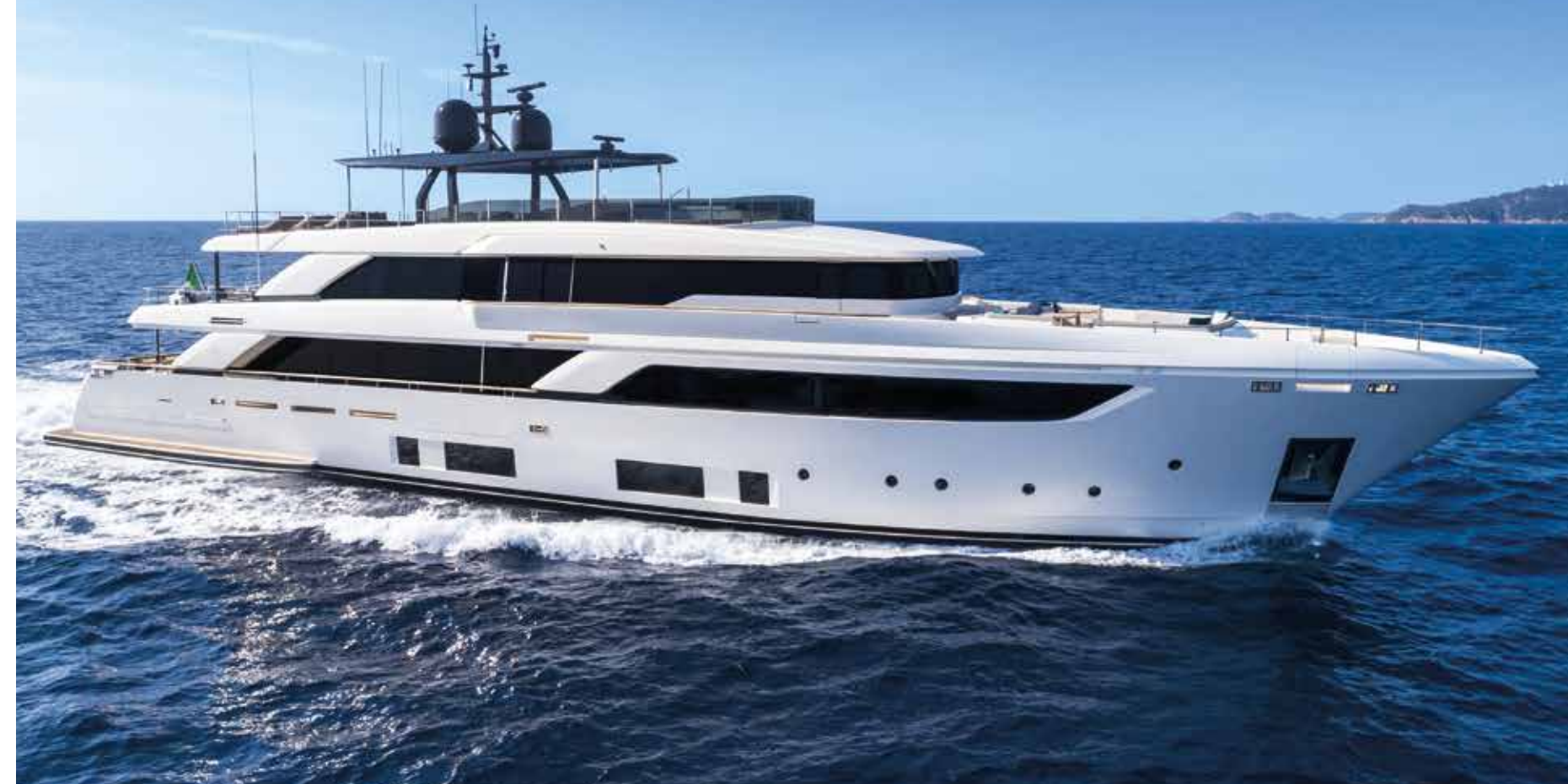
Custom Line 42 Navetta won Best Innovation Trophy for vessels 38m-50m at the long-standing World Yachts Awards run by Yachts France at a gala dinner on the Croisette

Yards are constantly challenged to stand out amid their impressive