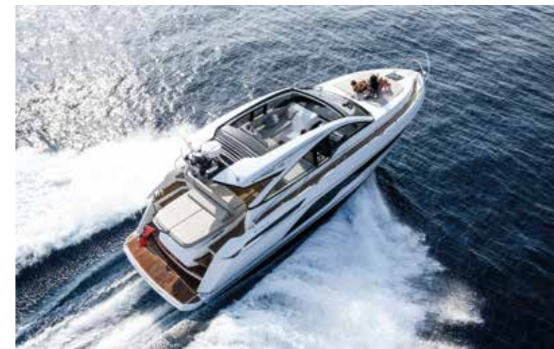
Fairline 43 Targa reviewed this issue also acquired a World Yachts Award for Best Exterior Design 14m-18.5m

Vuitton and Groupe Arnault. In January 2016, L Capital merged with Catterton to become L Catterton, now recognised as the largest global consumer-focused investment firm.