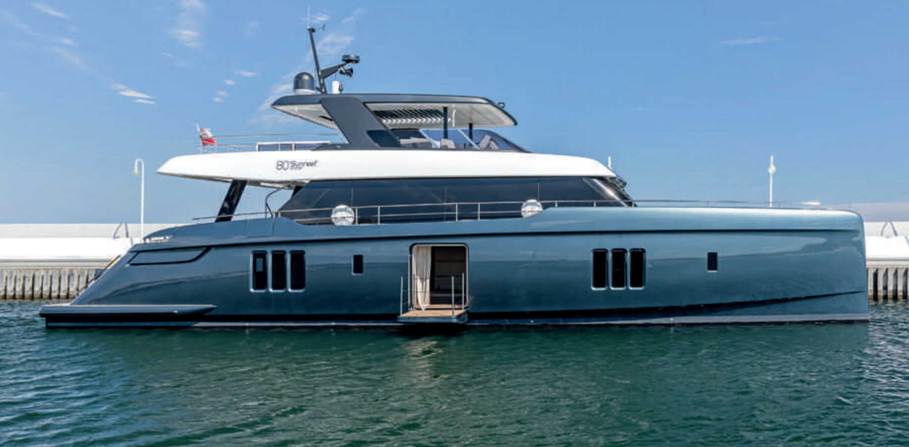
Rafa Nadal's customised 80 Sunreef Power, featuring a drop-down balcony in the master suite, was delivered to his home port in Mallorca in June