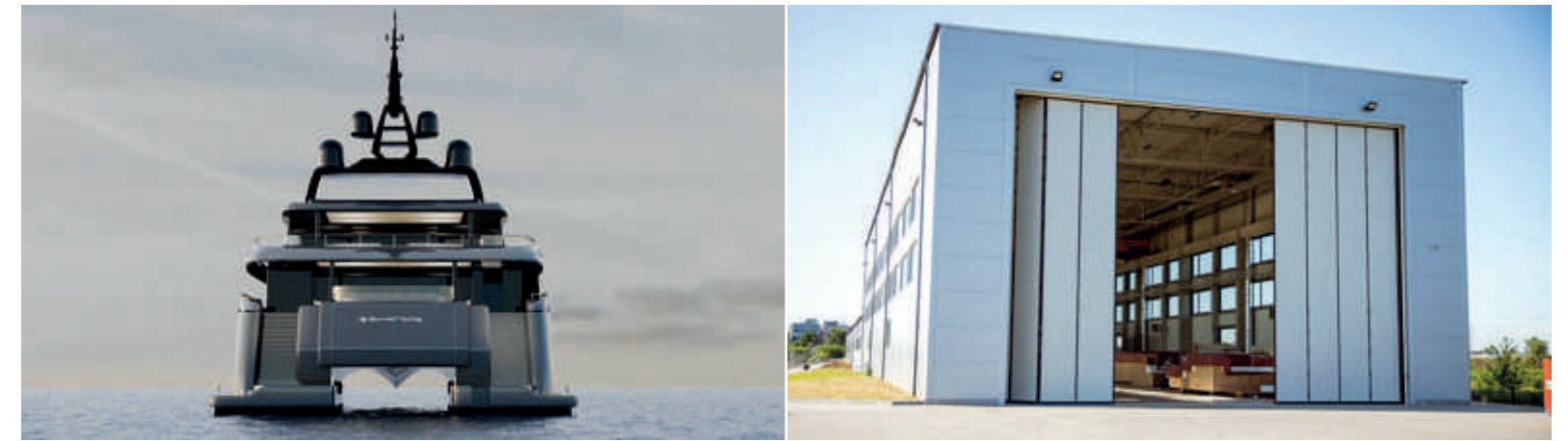
A render of the 49M Sunreef Power (left), the builder's biggest-ever yacht at 161ft and due for delivery in late 2021; a hall at Sunreef's new shipyard (right)

Before commissioning the 80 Sunreef Power, Nadal and his family chartered a Sunreef sailing catamaran.