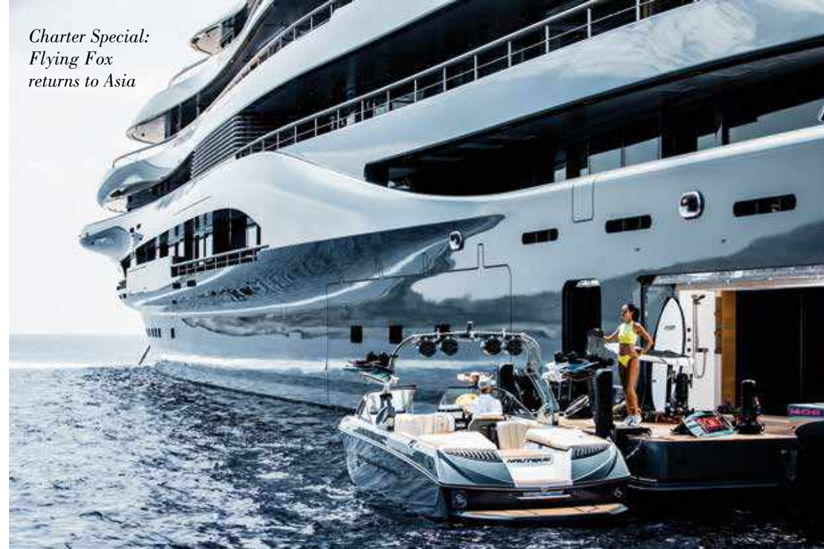
Charter Special: Flying Fox returns to Asia