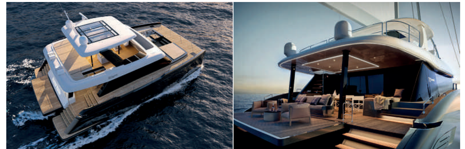
The world premieres of both the 60 Sunreef Power (left) and Sunreef 70 sail catamaran (right) are due to be held at the Cannes Yachting Festival

The trend for eco yachting is the most positive thing that's happened to the industry so far. We'll see what the dynamic of such developments will be in two years, but I can tell you that we are