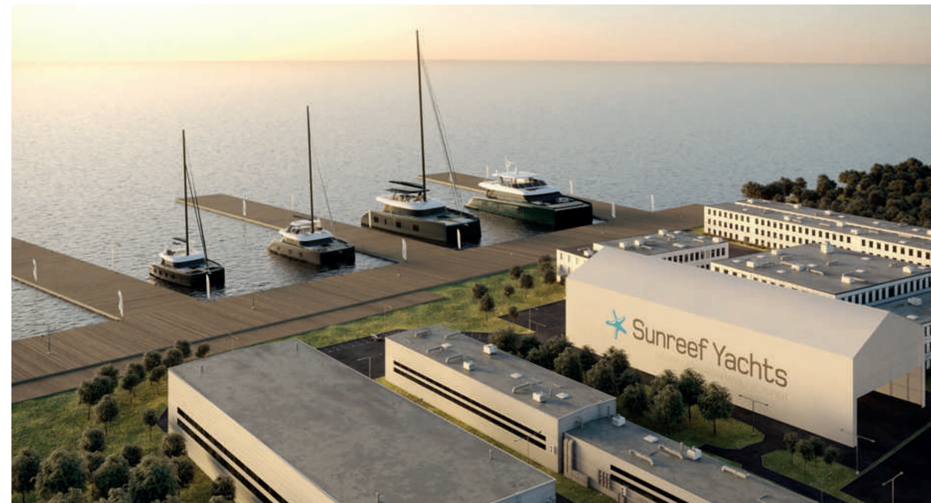
After almost two decades at the historic Gdansk Shipyard, Sunreef is moving to a new 80,000sqm site (below) beside the Martwa Wisla river

It's obviously an important chapter in Sunreef Yachts' history. I see our time there and our move as a good thing, an evolution. I don't think I will be sad to leave, but I'm sure I will be proud. The aura of the