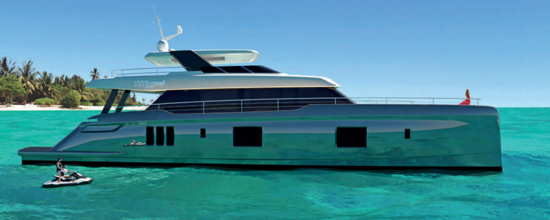
The first 100 Sunreef Power was sold earlier this year and will feature a specially customised main-deck interior featuring a lounge, bar and fitness room