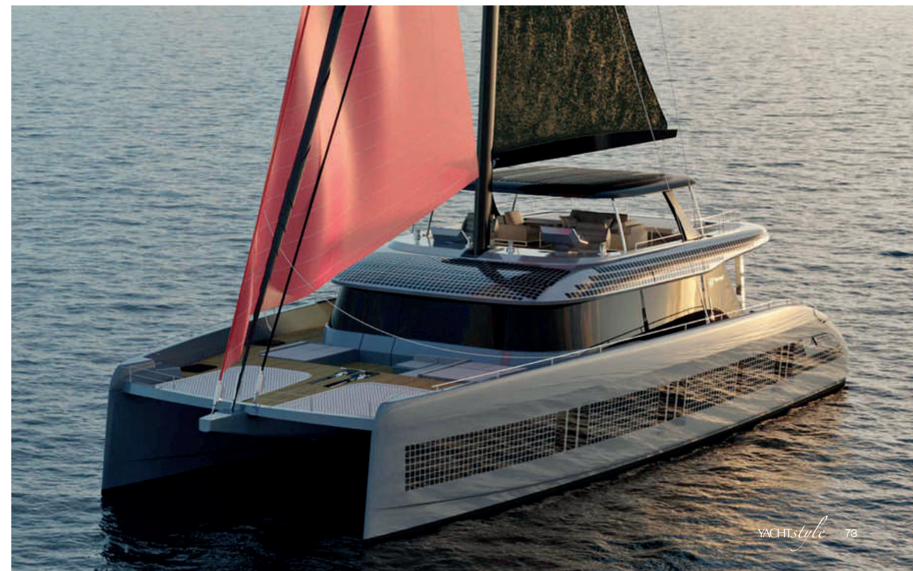
The Sunreef 70 Eco (pictured) is among four models in the Eco range, which was announced in late April and will begin with an 80 Sunreef Eco powercat