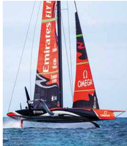
Event Preview:: 36th America's Cup