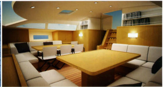
Swan 95: this athletic 29-metre sloop with German Frers lines is available in both a flush-deck and semi-raised version.