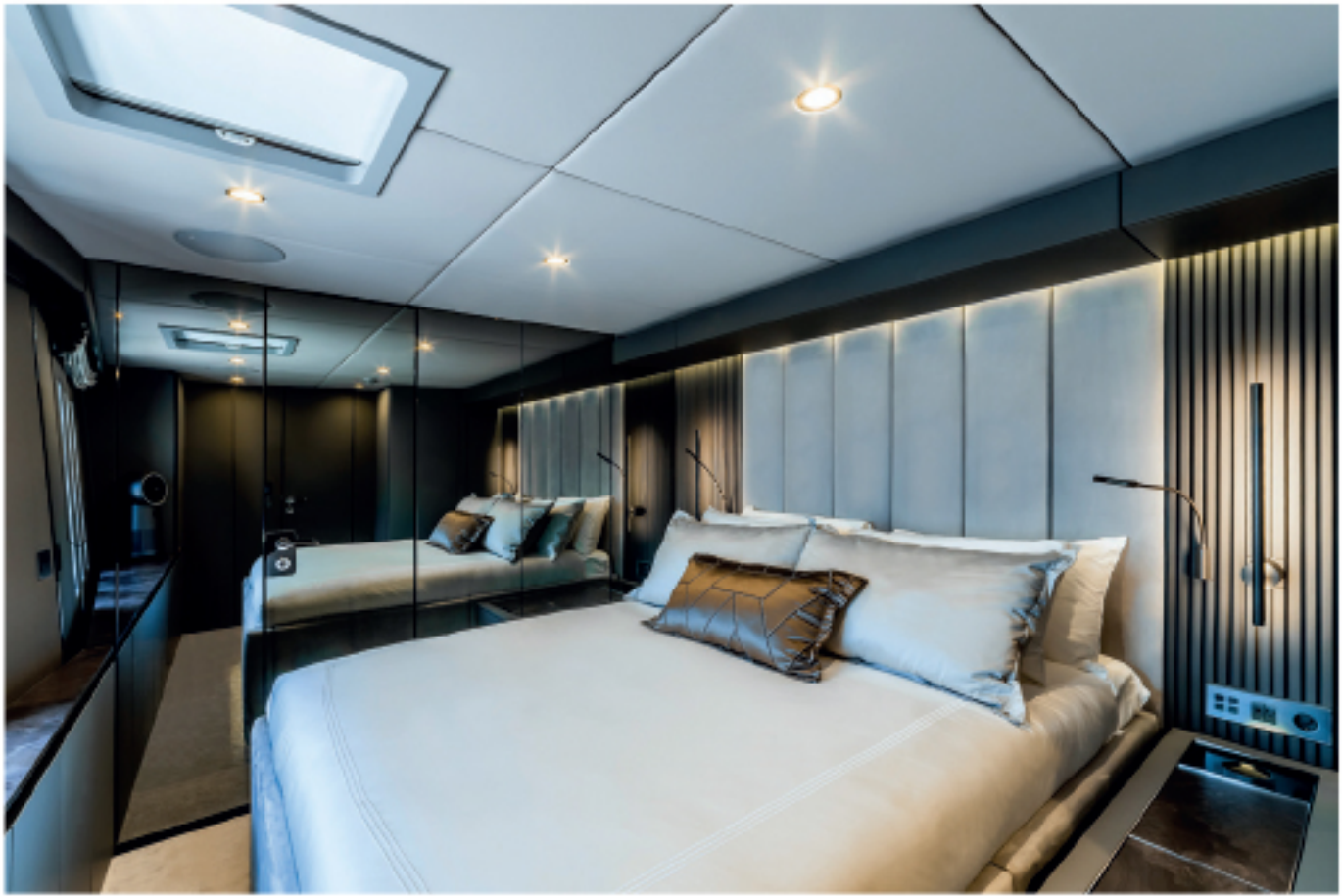
In the hulls, the cabins offer incredible levels of luxury.. ▲▲