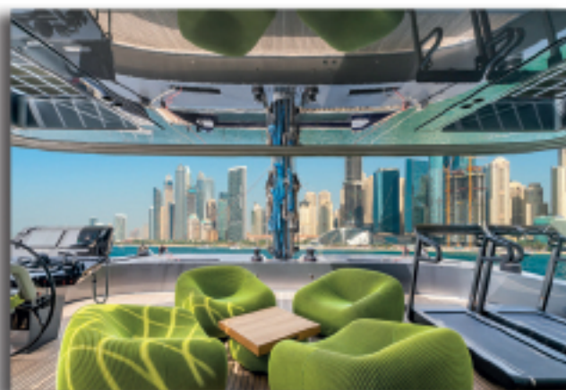
The flybridge is somewhat exposed to the wind when under way but is much sought-after at anchor. Note the two treadmills.