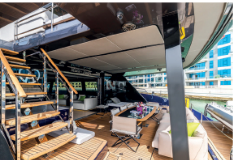
The aft cockpit opens onto a huge hydraulic platform.