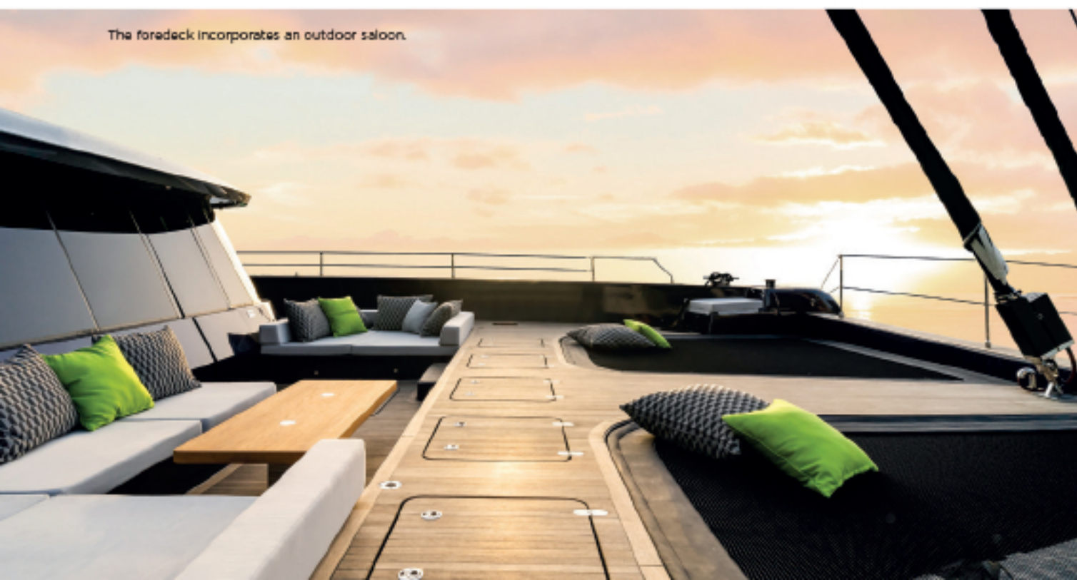
The foredeck incorporates an outdoor saloon.

But through this interface produced in-house by the shipyard, all technical monitoring of the multiyacht is also accessible at any time: diesel tanks, fresh water, waste water, pumps, lighting, navigation lights, and so on. Delivering a catamaran that is certainly innovative but reliable was a major challenge in order to satisfy a clientele used to perfection. Many functions therefore incorporate redundancy, with one piece of equipment in use and another on stand-by, but immediately available. This is the case with the inverter, working off the 24V batteries to power lighting, electronics, electric blinds, etc. Somewhat more incongruous: aboard this boat, which prides herself on being ecological, two generators have been installed. So far, they have not been used, says the