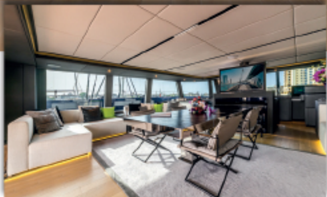
Central in the nacella, a huge table can be used that seats up to 15 guests.

without any recharging. Logically, on board, apart from the aft platform, which is hydraulic, everything is electric - from the winches to the furling of the headsails and the cooker hobs. Given that the most ecological way to travel is under sail, the fully-battened mainsail is traditionally mounted on battens cars and not on a furler. The port authorities wouldn't allow us to test the catamaran offshore, so we had to contend with the outer harbor for seeing how she performed under sail. The displacement of the 80 ECO was not communicated by the builder, and we suspect it to be pretty significant considering the volume and the equipment offered. The expected performance under sail in light winds is modest - 4 to 5 knots - but the waterline length ensures averages above 10 knots if the wind deigns to exceed 15 knots. Sunreef's know-how is not limited to high technology. The deck layout of this 80-footer is immediately operational for a professional crew of just two. As quiet under sail, a hydro-generation system adds to the on-board recharging systems.