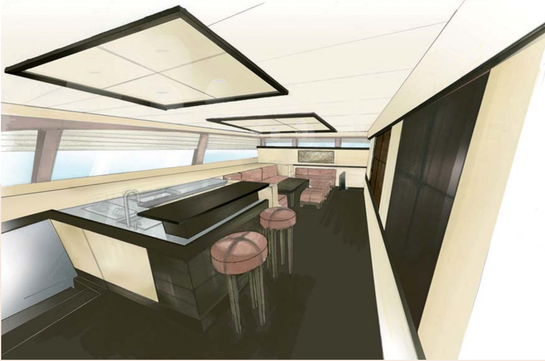
▲ The saloon room ▼ The dining room